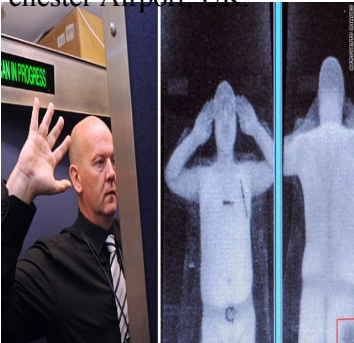
A new body scanner is tested by an employee of Manchester Airport, UK

be debated, national security worldwide is making efforts to ensure safe traveling for all.